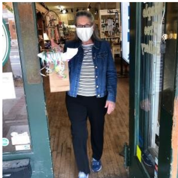
Downtown Danville is masked up and ready to assist you with all your shopping needs. In-person or pick-up/ carry out. We've got you covered!

The 2020 LaGrange Arts Fest and Traskside Market! Saturday, September 12th 9am-5pm! We will be filling East Main and Walnut with vendors. Don't forget the Farmers Market Artisans on the courthouse lawn.