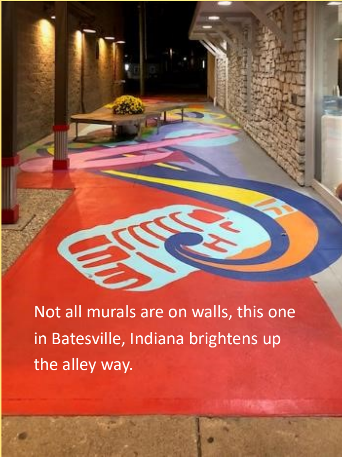
Not all murals are on walls, this one in Batesville, Indiana brightens up the alley way.