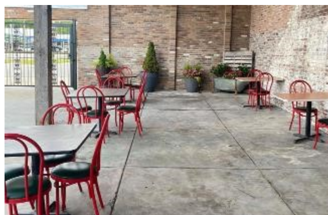
American Café in downtown Guthrie has re-opened just in time for Take-Out Tuesday! They have completed work on the outdoor patio and are ready to serve you.

The 2020 LaGrange Arts Fest and Traskside Market! Saturday, September 12th 9am-5pm! We will be filling East Main and Walnut with vendors. Don't forget the Farmers Market Artisans on the courthouse lawn.